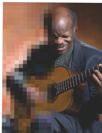
Clearly Better Sound

At first the bass may sound a little light until you become attuned to hearing more of the bass notes because they don’t hit you muddled and squashed into a big pile but flow to you as you would naturally experience them in reality.